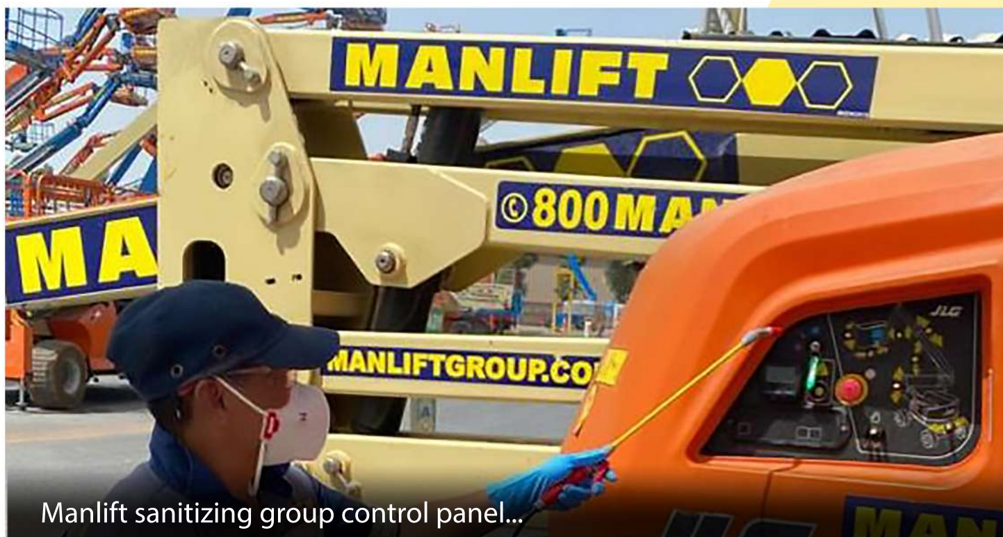
Manlift sanitizing group control panel...